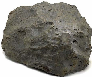
'Cranbourne no. 2' weighing just 1525 kilograms.

Some time in the dim past, a group of iron meteorites crashed to earth in a line to the south of the present city of Cranbourne. Reports of chunks of meteorites started appearing in the 1850s as farmers dug them up while ploughing. Local Aborigines reputedly used to dance around one meteorite chunk, thinking it sacred.