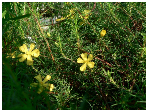
Hibbertia blooming in the Nursery.