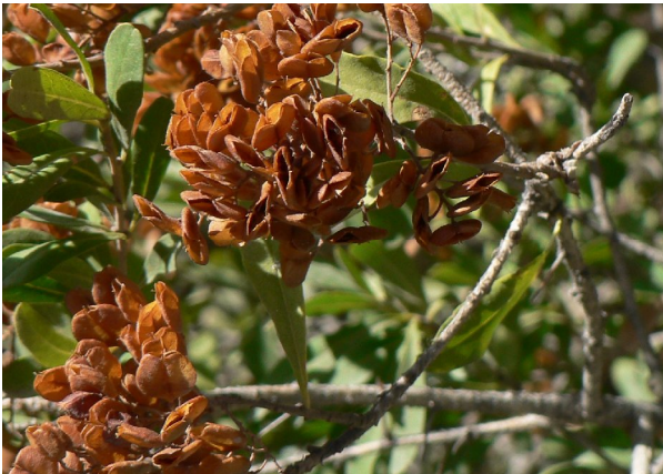
Bursaria spinosa seed capsules opening

Indigenous plant growers have long held the belief that by collecting seed only from local remnant vegetation, they are doing the best possible thing to produce plants that have grown acclimatized to local conditions.