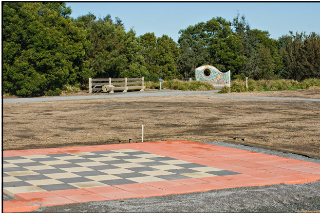
The giant chess board on Howard Trail

Ranger Ernie led a tour of the area on a hot December day last year so that Wednesday Project workers and other volunteers could get an overview of what has been achieved. The amount of successful regeneration, including natural revegetation, is nothing short of amazing. It is also gratifying to note the large number of understorey plants, such as grasses and wildflowers that are thriving in the area.