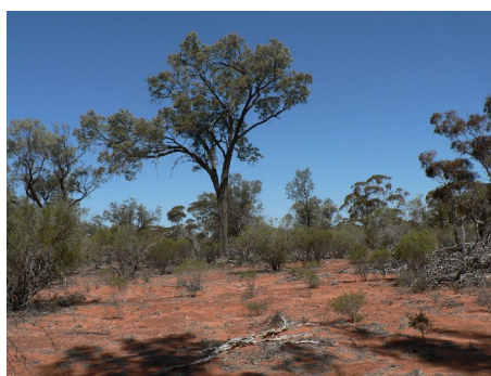
Belah woodland at Scotia Reserve, NSW

Government and industry funding is enabling purchase and revegetation of private land to form the corridors. A description of this project is in the US Wildlands Network site: http://www.twp.org/cms/page1237.cfm