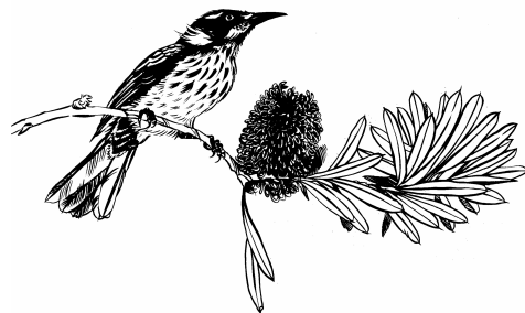
New Holland Honeyeater

Visit the community garden, the muralled art walls or walk where Phar Lap's hooves have pounded the turf along the Red Gum Trail.